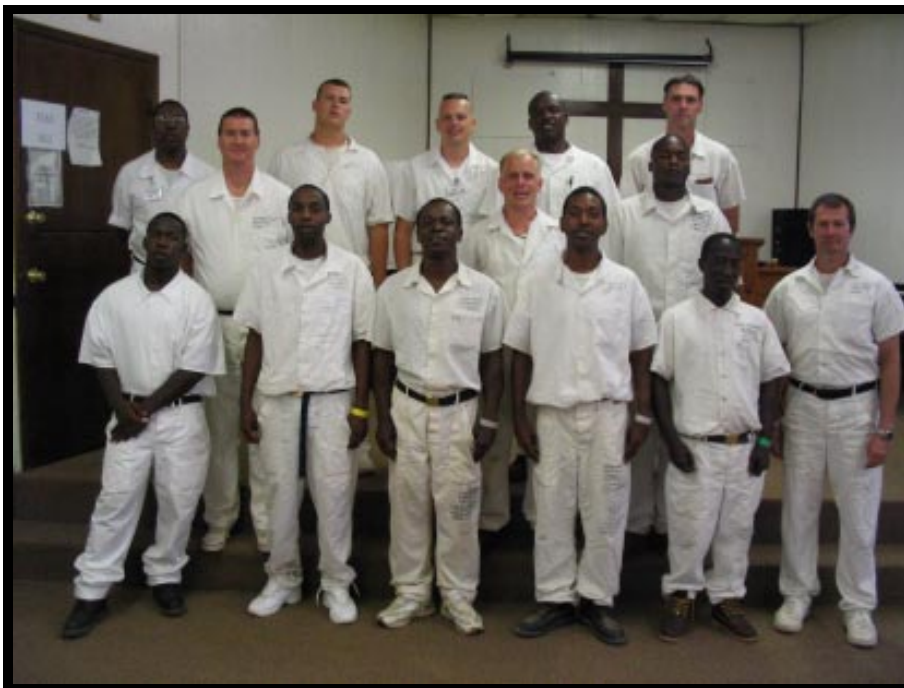
Current students participating in the Fountain Chapel Pre-GED Program are eagerly working towards their GED.