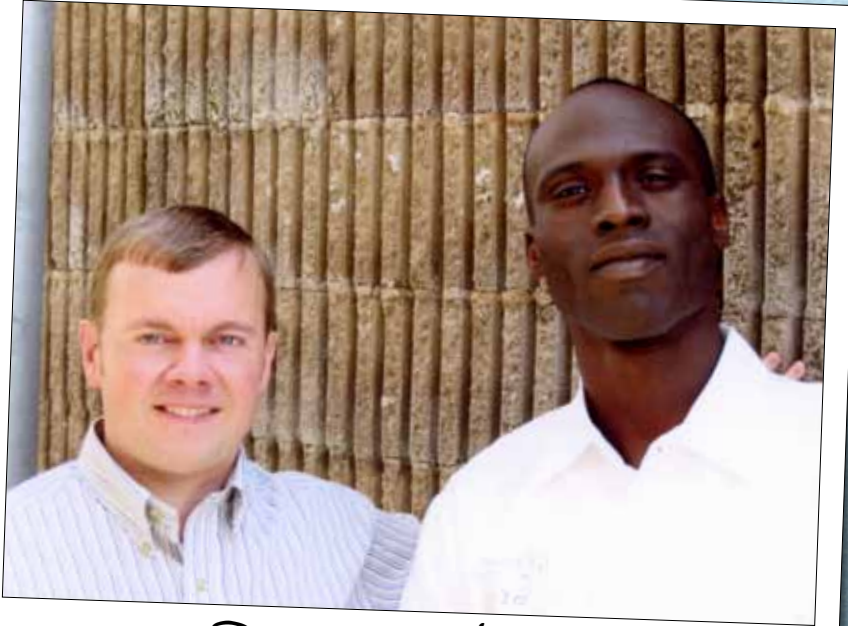
Prison - April 2005