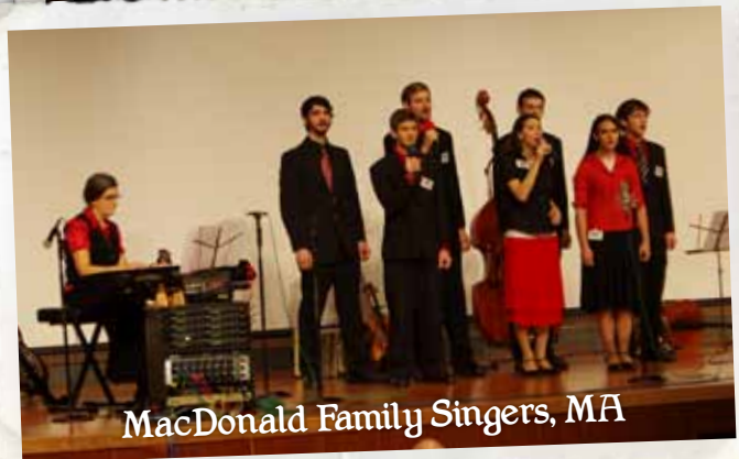
MacDonald Family Singers, MA