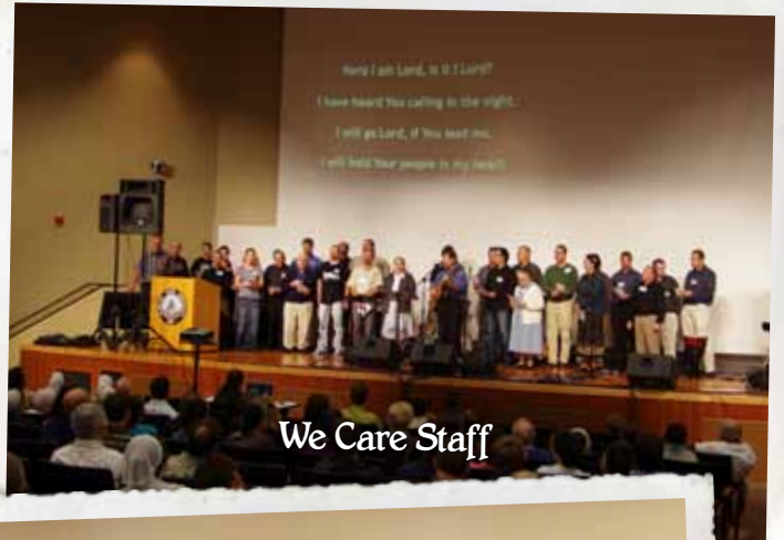
We Care Staff