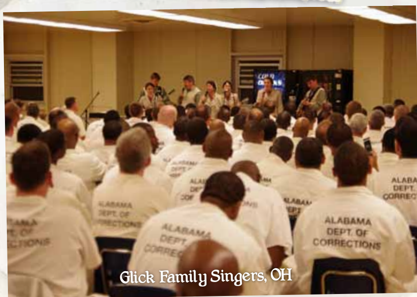
Glick Family Singers, OH