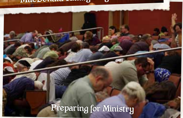
Preparing for Ministry